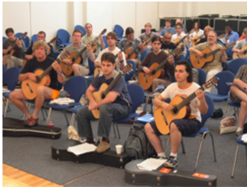
Students rehearsing in the Mannes Concert Hall, MA